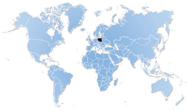
Fig. 1. Geographic scope of the market in butter in 1995 and 2000 according to the E-H method (national).